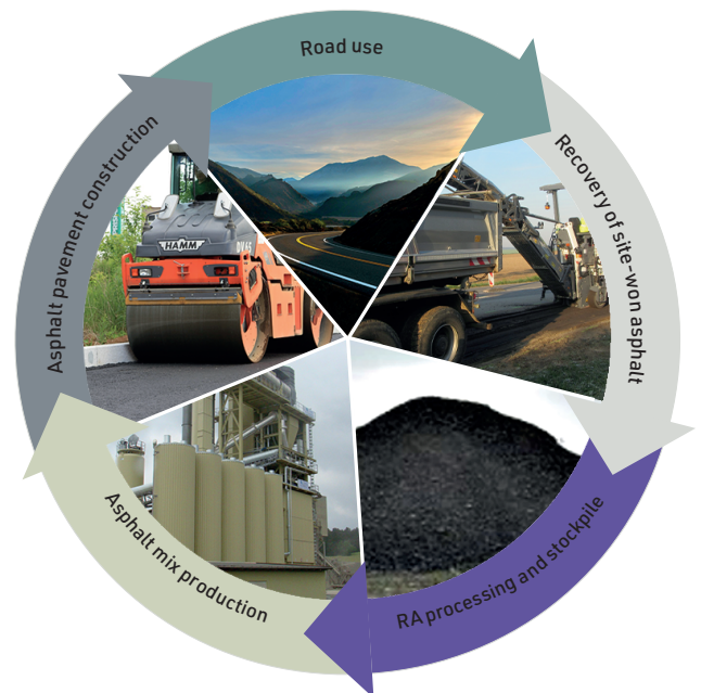
The circular economy of asphalt

Note: This is independent of manufacturing temperature, road layer, etc. Hence, it would include, for example, the manufacturing of cold mix asphalt from former warm or hot mix asphalt.